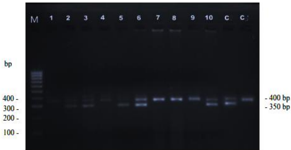
Figure 2: Electrophoresis the PCR product of the CHD gene from masked lovebirds. M= marker (hyperladder 100 bp), 1-10= lovebird samples, C♀= female control, C♂= male control.

The results of PCR amplification of the CHD gene in masked lovebird by NP, P2, and MP primer pairs were presented in Figure 2. It showed that in sample no: 1, 4, 7, 8, and 9 was seen a single DNA band in size of 400 bp to show that these five samples (50 %) were male masked lovebirds. Whereas in sample no: 2, 3, 5, 6, and 10 which generated two (double) DNA bands in the size of 350 bp and 400 bp, it showed that these five samples (50 %) were female masked lovebirds. Based on the interpretation presented in Table 2, from the ten samples of tested masked lovebirds, there were five male lovebirds and five female lovebirds.